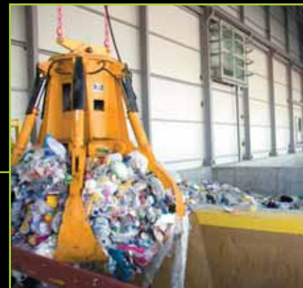
URBAN SOLID WASTE