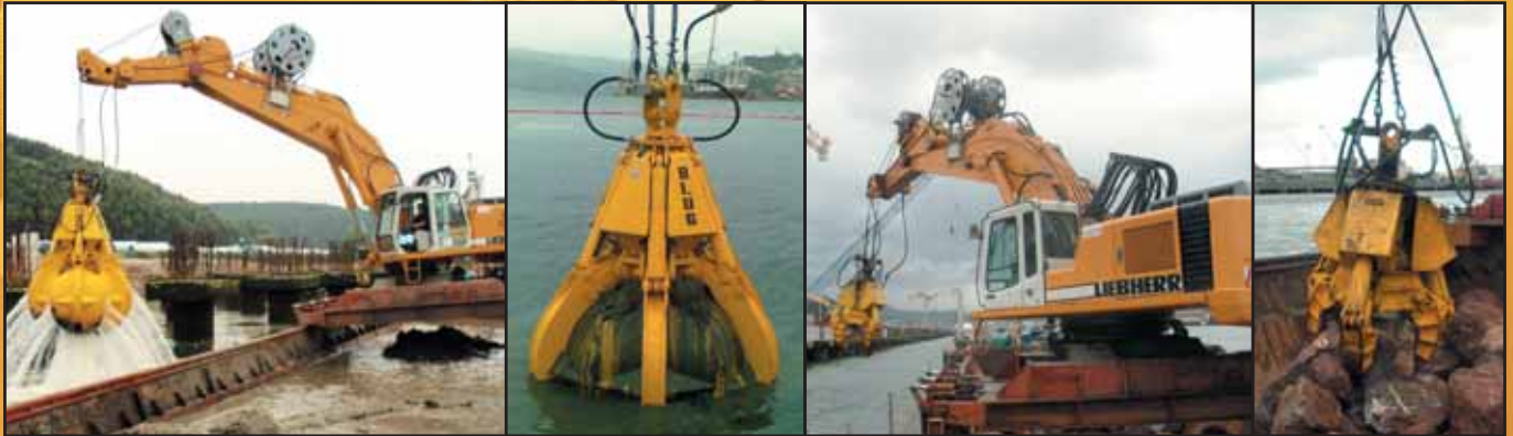
2 solutions for the same environment: Hydraulic orange peel grab for dragging. Hydraulic tong for breakwater rock.