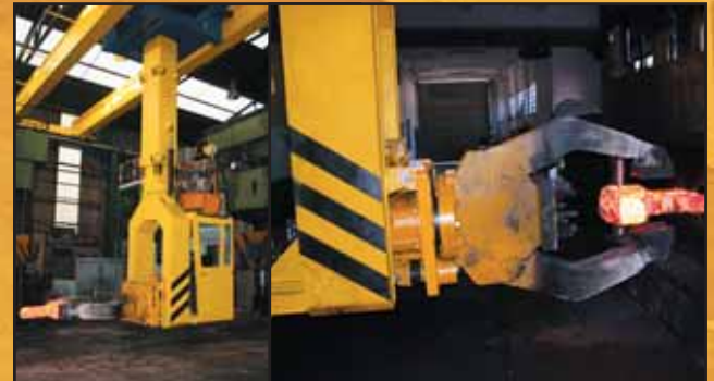
Forging tong on a telescopic manipulator. Integrated and assembled to the crane.