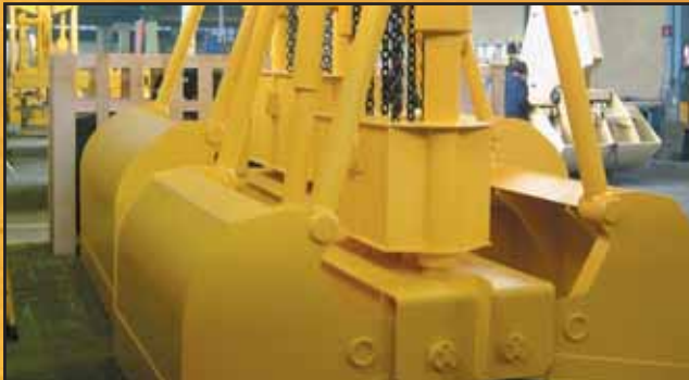
Single chain/rope operated automatic clamshell grabs.