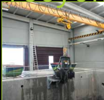
MUD AND SLIMES