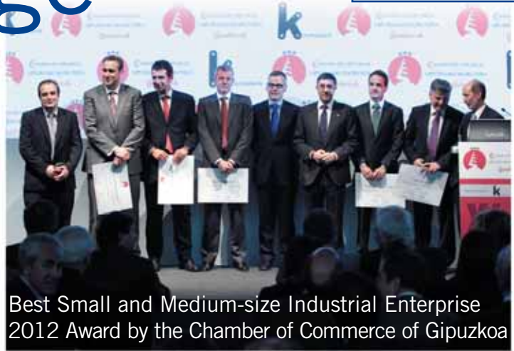
Best Small and Medium-size Industrial Enterprise 2012 Award by the Chamber of Commerce of Gipuzkoa