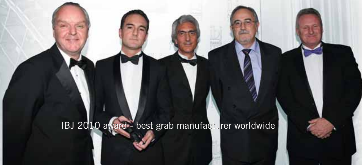
IBJ 2010 award - best grab manufacturer worldwide